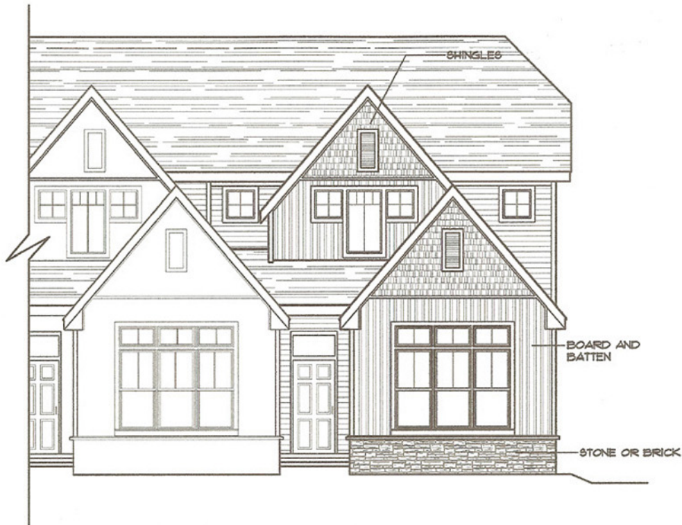
TWO STORY 3 BED 3 1/2 BATH ELEVATION